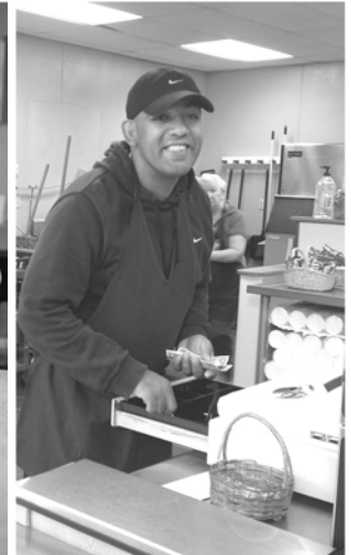
FOOD SERVICE / RETAIL